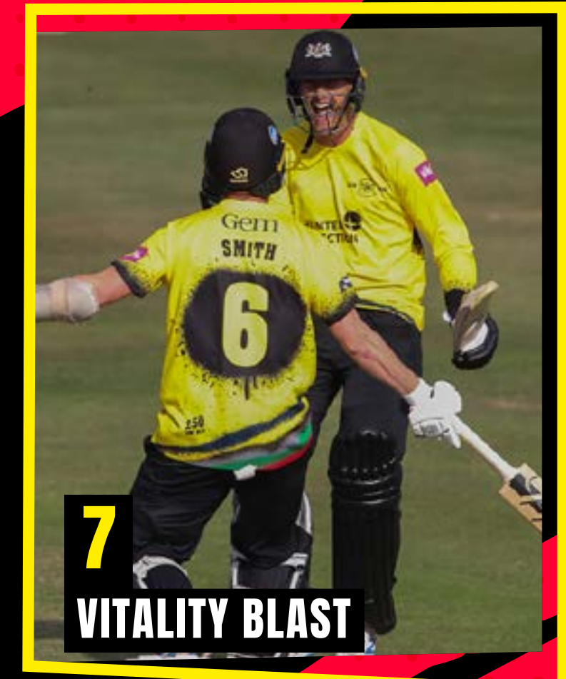
7 VITALITY BLAST