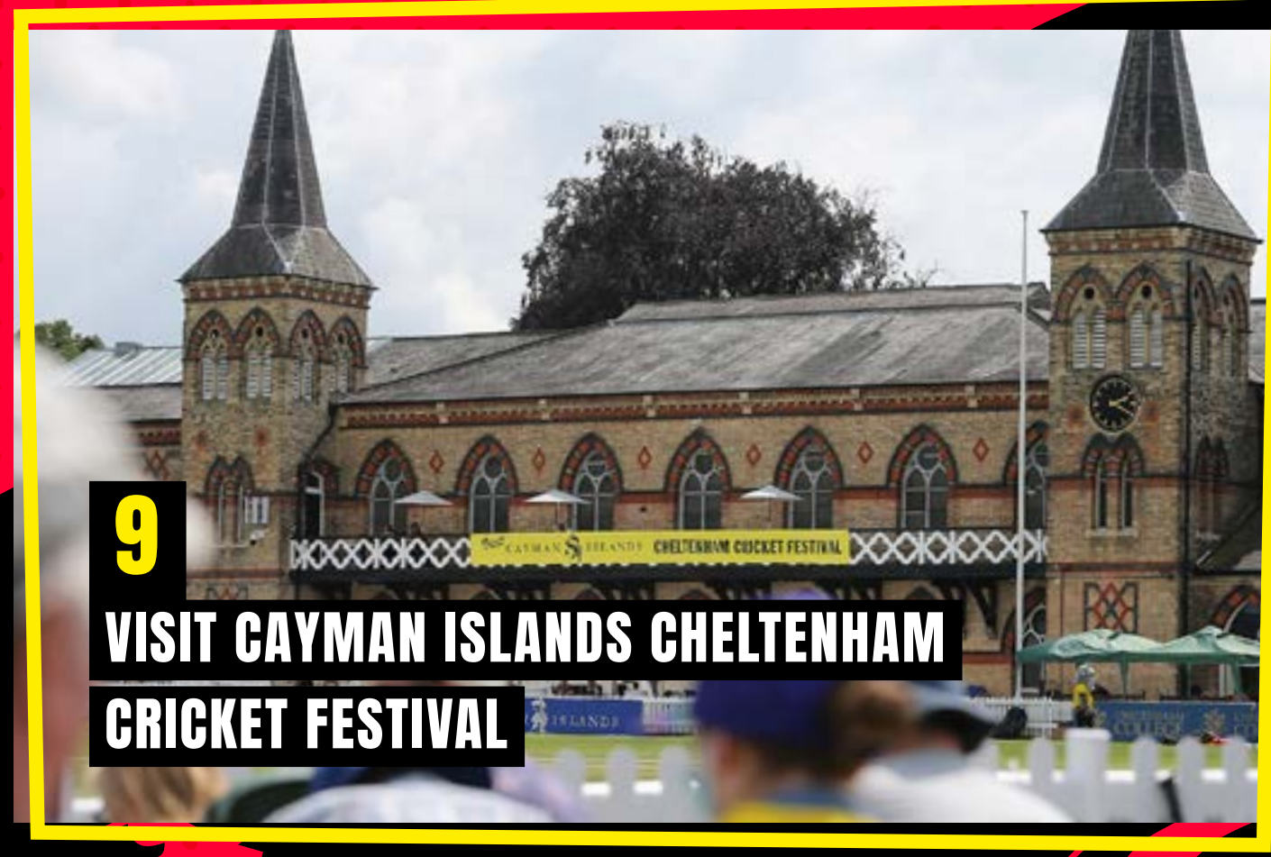
9 VISIT CAYMAN ISLANDS CHELTENHAM CRICKET FESTIVAL