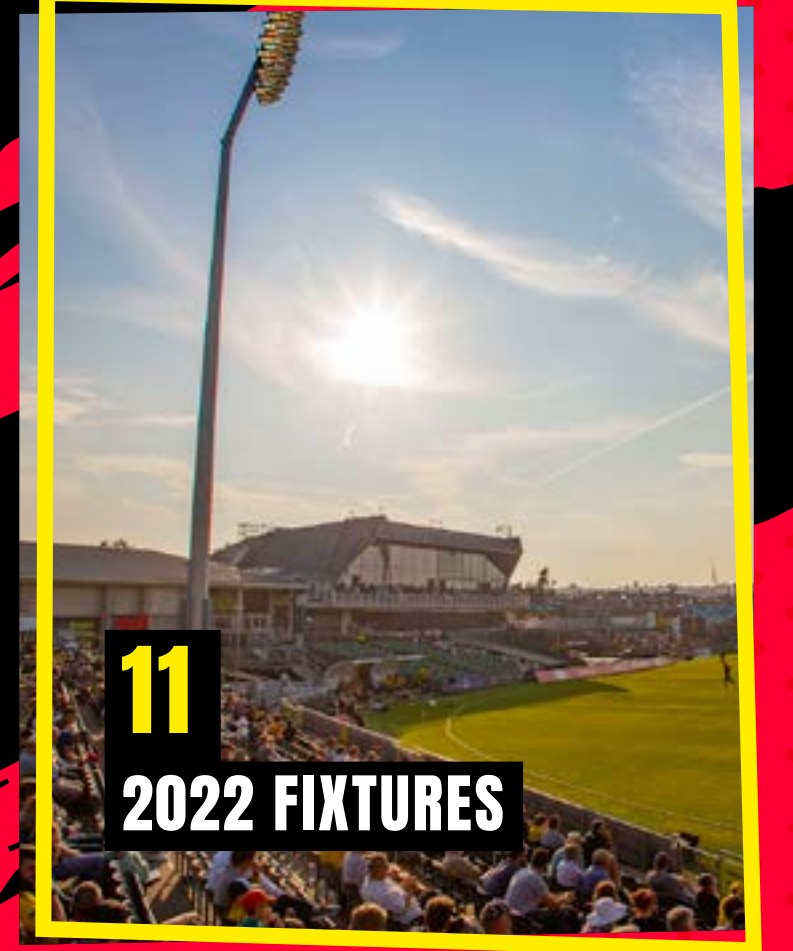
11 2022 FIXTURES