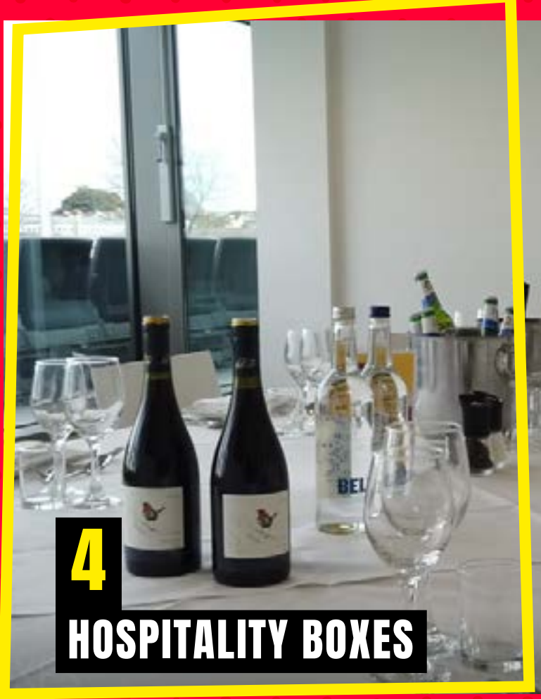
4 HOSPITALITY BOXES