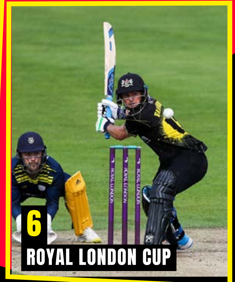
6 ROYAL LONDON CUP