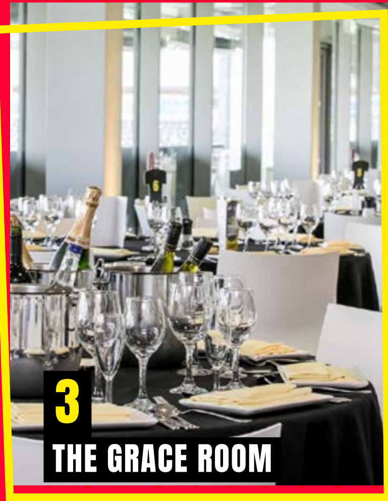
3 THE GRACE ROOM