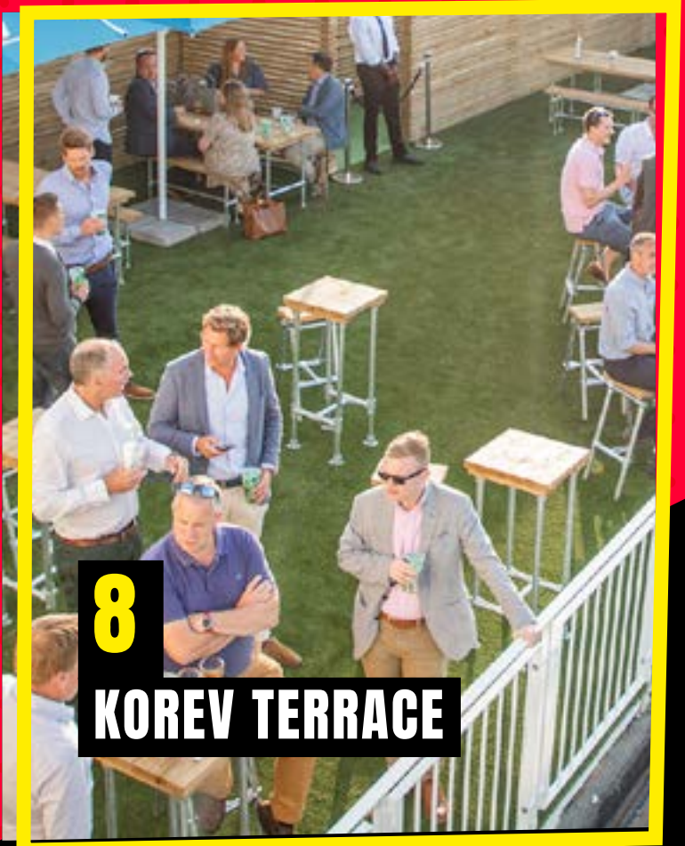
8 KOREV TERRACE