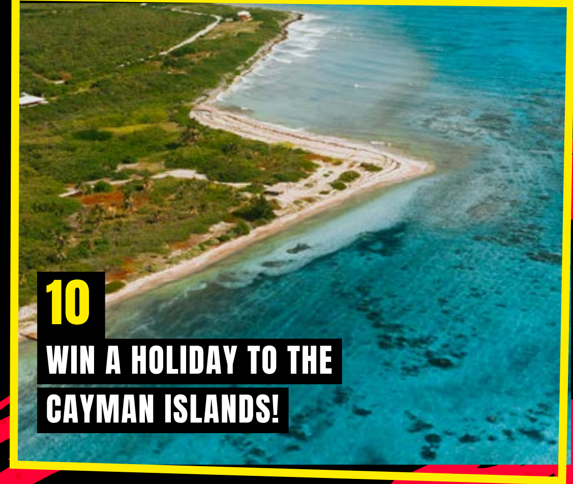
10 WIN A HOLIDAY TO THE CAYMAN ISLANDS!