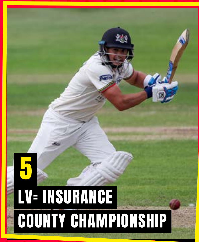
5 LV= INSURANCE COUNTY CHAMPIONSHIP