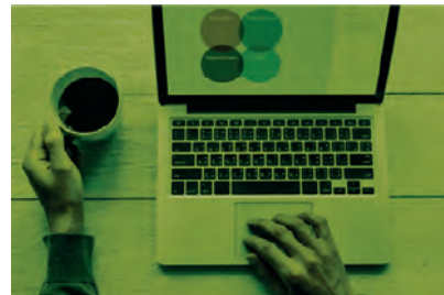
social media management